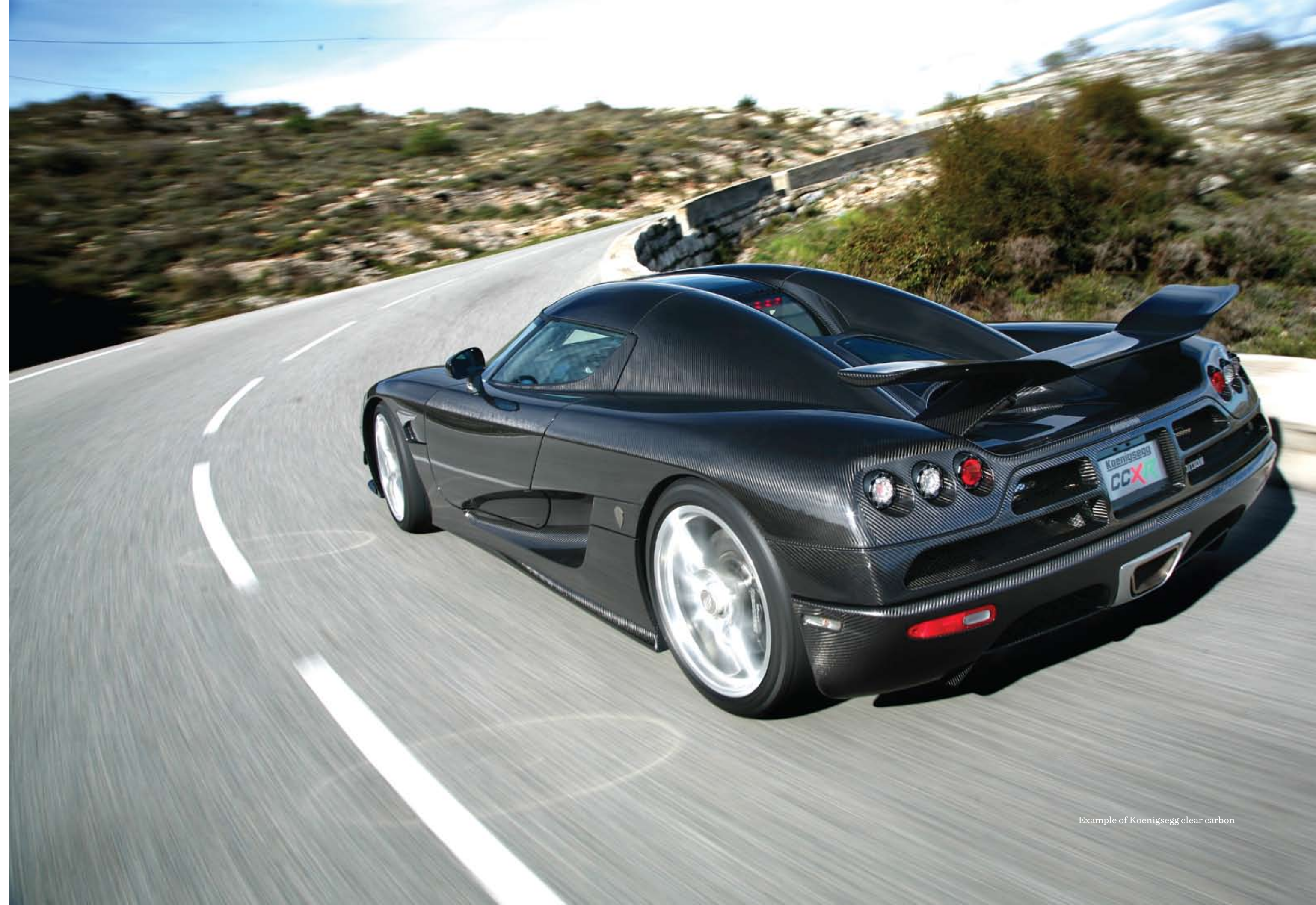
Example of Koenigsegg clear carbon

Koenigsegg cars are ultimate driving machines . They are stiffer, faster and more responsive than any other cars known to us. The chassis are built from extremely lightweight carbon fibre composite. Reinforced with Kevlar and aluminium honeycomb for even greater performance. The race-bred Koenigsegg Advanced Control System (KACS) keeps the driver in total control of every movement, even under the toughest racing or road conditions. A Koenigsegg can be adjusted to suit every individual driving style, from the adrenalin rush of the racetrack to comfort settings for your long-haul tour.